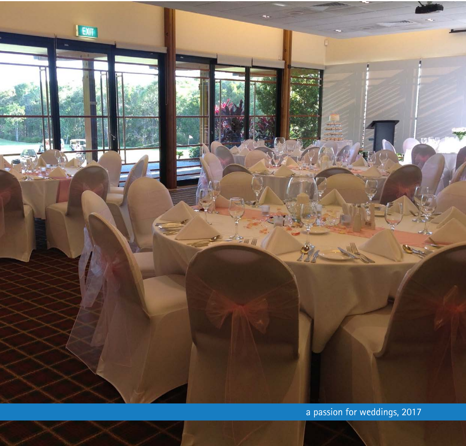
a passion for weddings, 2017